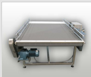
Accumulation & Surge Conveyor