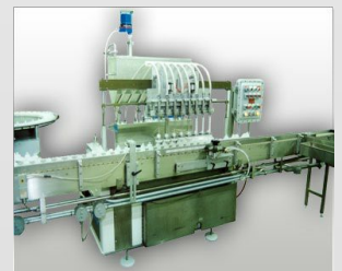
Bottle & Can Filling Lines

Project Management • Engineers • Fabricators • Installers