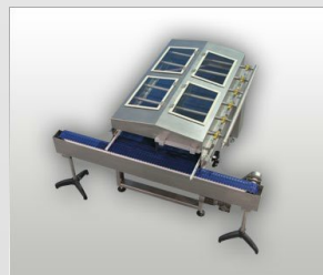
Bottle Cooling Tunnel