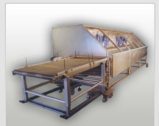
Cooling Conveyor Systems

Project Management • Engineers • Fabricators • Installers