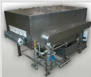
Chilled Water Cooling Tunnel