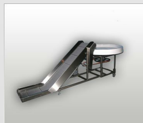
Packaging Incline Conveyor with Pack Off Turntable