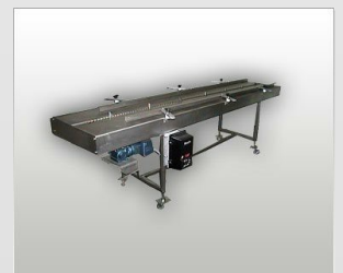
Lug Packaging Infeed Conveyor

Project Management • Engineers • Fabricators • Installers