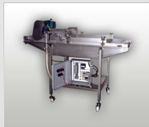
Batter Applicator Dicing Conveyor