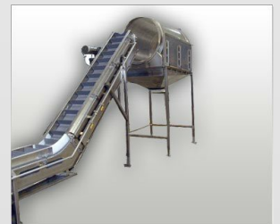
Seasoning Tumbler with Incline Conveyor

Project Management • Engineers • Fabricators • Installers