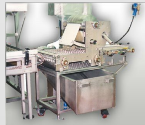
Pizza Sauce Waterfall Depositor