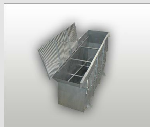
Waste Water Tank