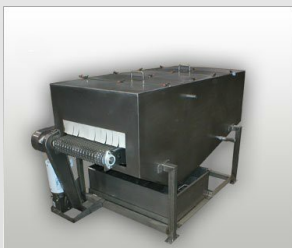
CIP Wash Conveyor System