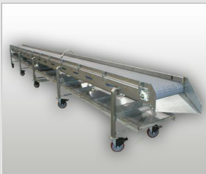
Sanitary Process Conveyor