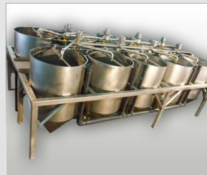
Tank Farms, Corn Soak Systems