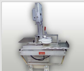
Pizza Crust Trimmer