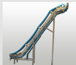
Lift & Speed Clean Conveyor System