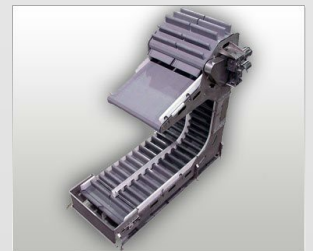
Vertical Captiveyvor, C-Frame Conveyor

Project Management • Engineers • Fabricators • Installers