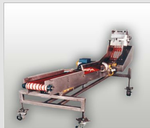
Ribbon Belt Conveyors