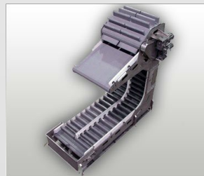
Vertical Captiveyvor, C-Frame Conveyor