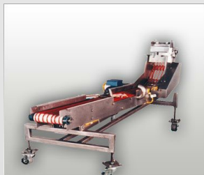
Ribbon Belt Conveyors