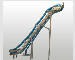
Lift & Speed Clean Conveyor System

Project Management • Engineers • Fabricators • Installers