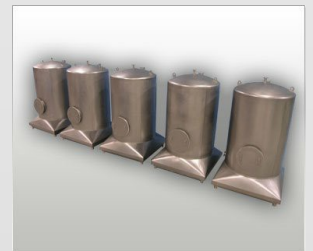
Sanitary Process Tanks

Project Management • Engineers • Fabricators • Installers