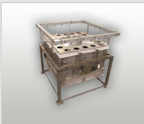
Coffee Bean Silo Blending Scale Hopper