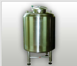
Sanitary Tanks & Silos