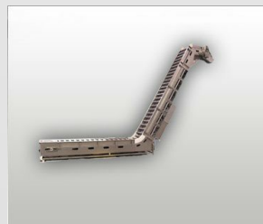
Custom Incline Conveyors