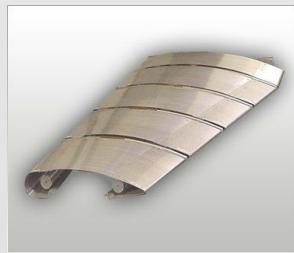
Architectural Metal Designs