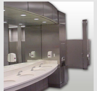
Stainless Steel Architectural Trim

Project Management • Engineers • Fabricators • Installers