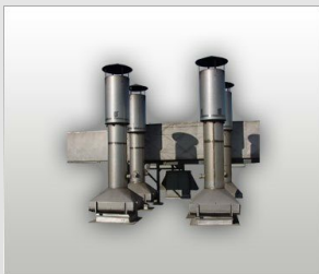
Process Area Air Quality Control Stack Systems