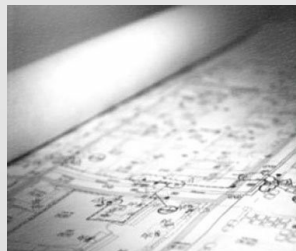
Process & Packaging Systems Integration